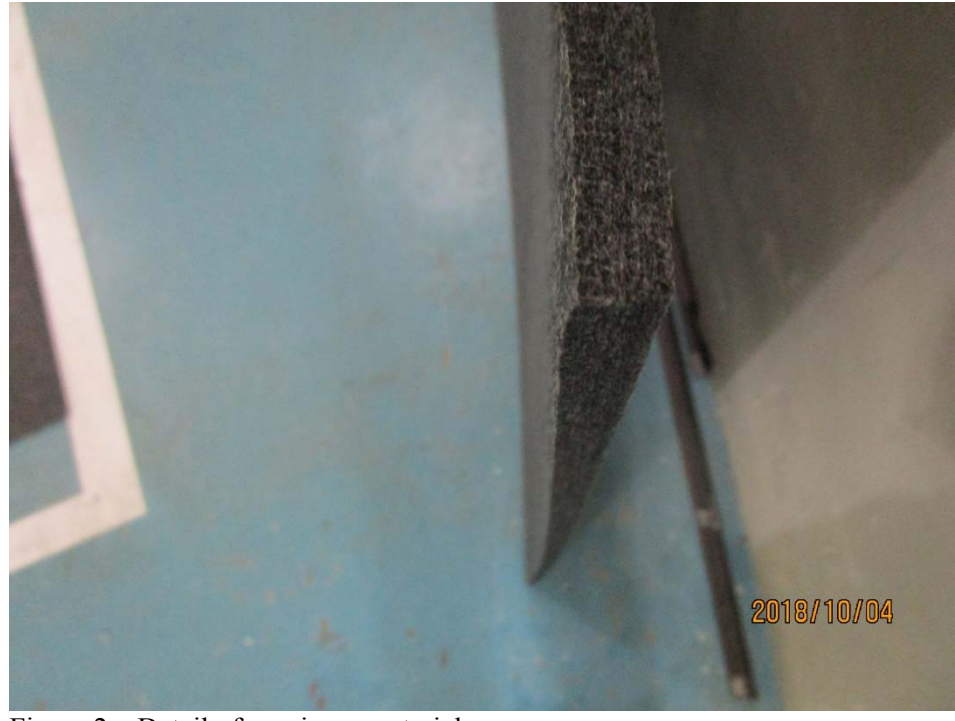
Figure 2 – Detail of specimen material