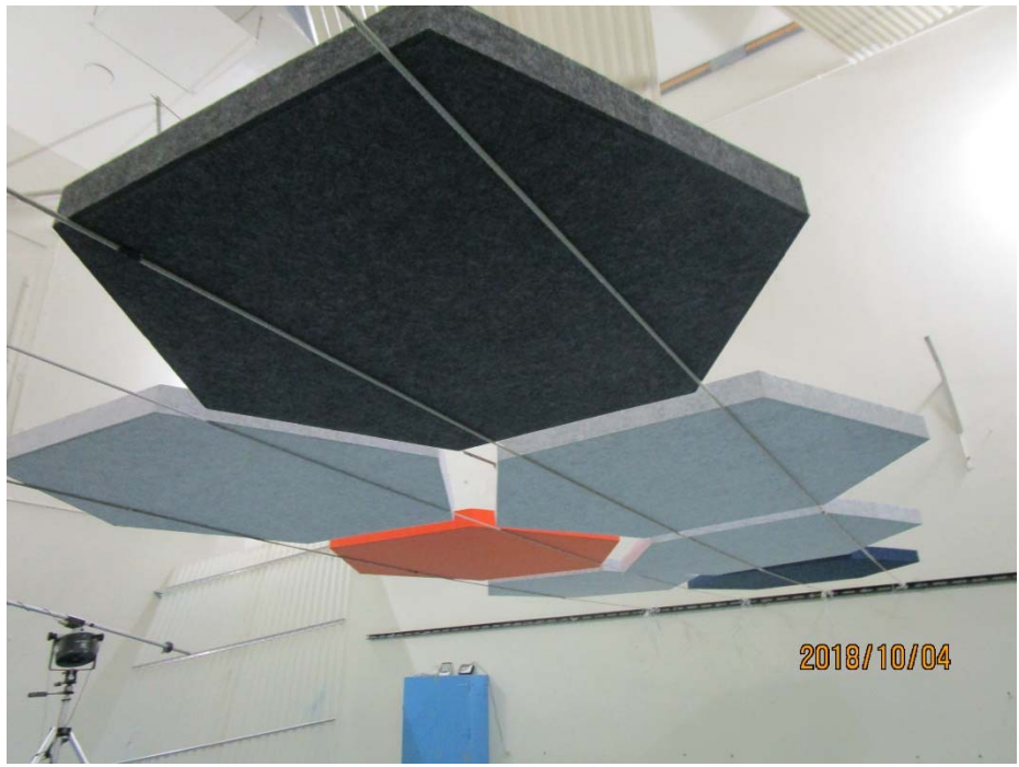
Figure 2 – Underside of mounted specimen