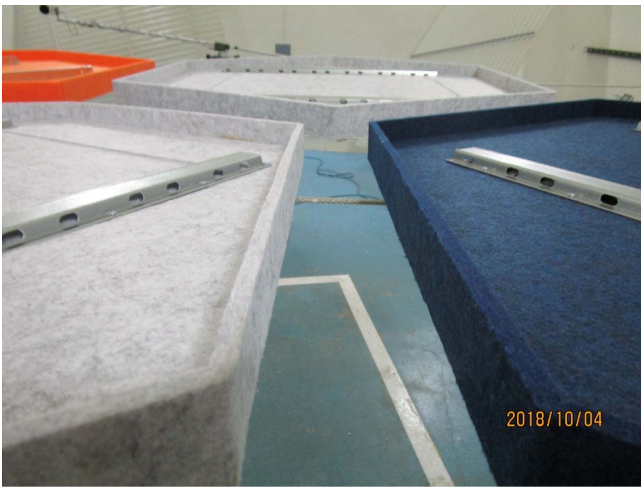
Figure 3 – Detail of specimen material, air space