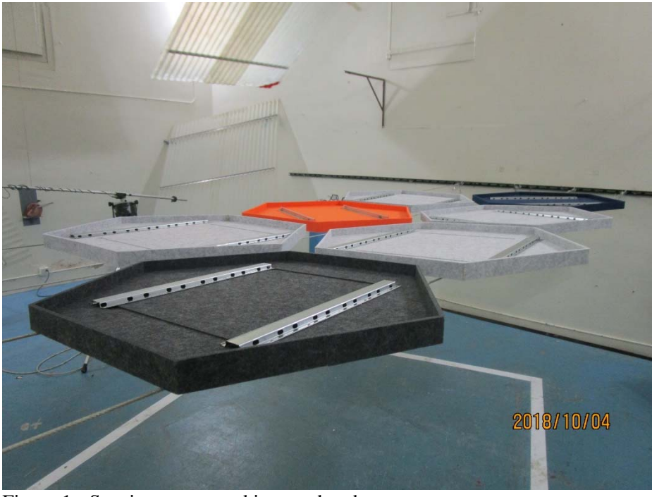
Figure 1 - Specimen mounted in test chamber