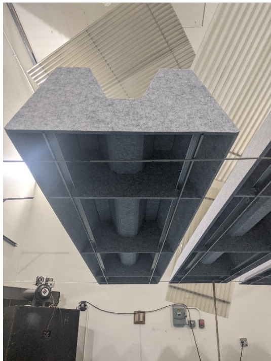
Figure 3 – Underside of individual shell, steel and felt structural members