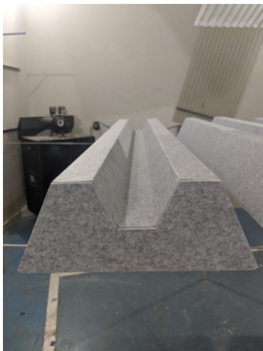
Figure 2 – Corrugated trapezoid profile